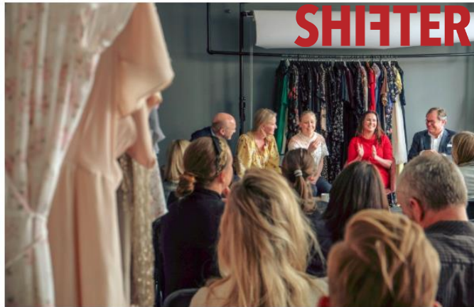
Fra FJONGS frokostseminar tidligere i vår. Tema: Kvinner på elersiden.

Kvinner investerer sjelden i oppstartsselskaper, men Fjong satte trolig Norgesrekord i både folkefinansiering og kvinneandel.